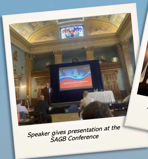
Speaker gives presentation at the SAGB Conference