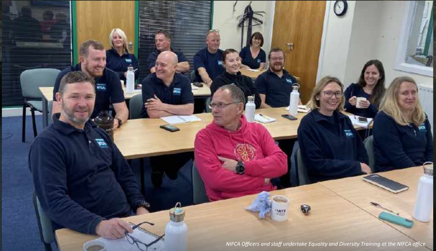
NIFCA Officers and staff undertake Equality and Diversity Training at the NIFCA office

The NIFCA team were delighted to welcome a trainer from Equality and Diversity UK to the office in November. She took the Officers and staff through the developments in the Equality Act, with a look at the 9 protected characteristics. She facilitated thought-provoking discussion to bring about self-reflection on our personal and professional lives, to better understand the unconscious biases which exist within everyone.