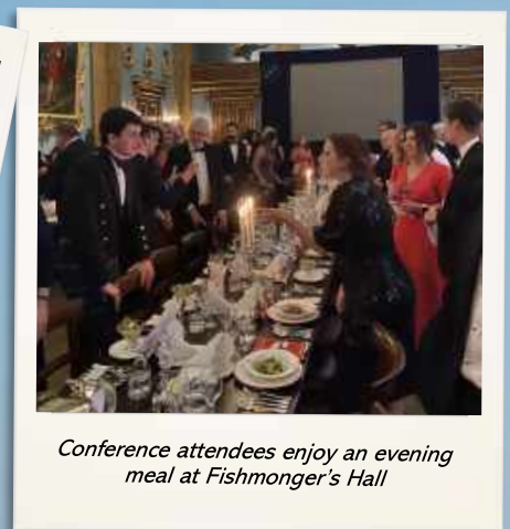
Conference attendees enjoy an evening meal at Fishmonger's Hall