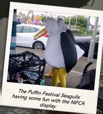
The Puffin Festival Seagulls having some fun with the NIFCA display