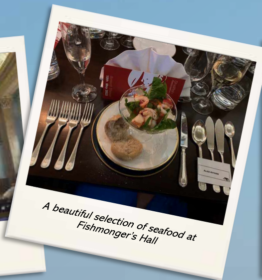
A beautiful selection of seafood at Fishmonger's Hall