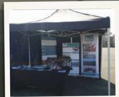
NIFCA stall at Operation Seabird, Amble Harbour in June