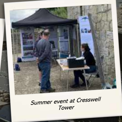
Summer event at Cresswell Tower