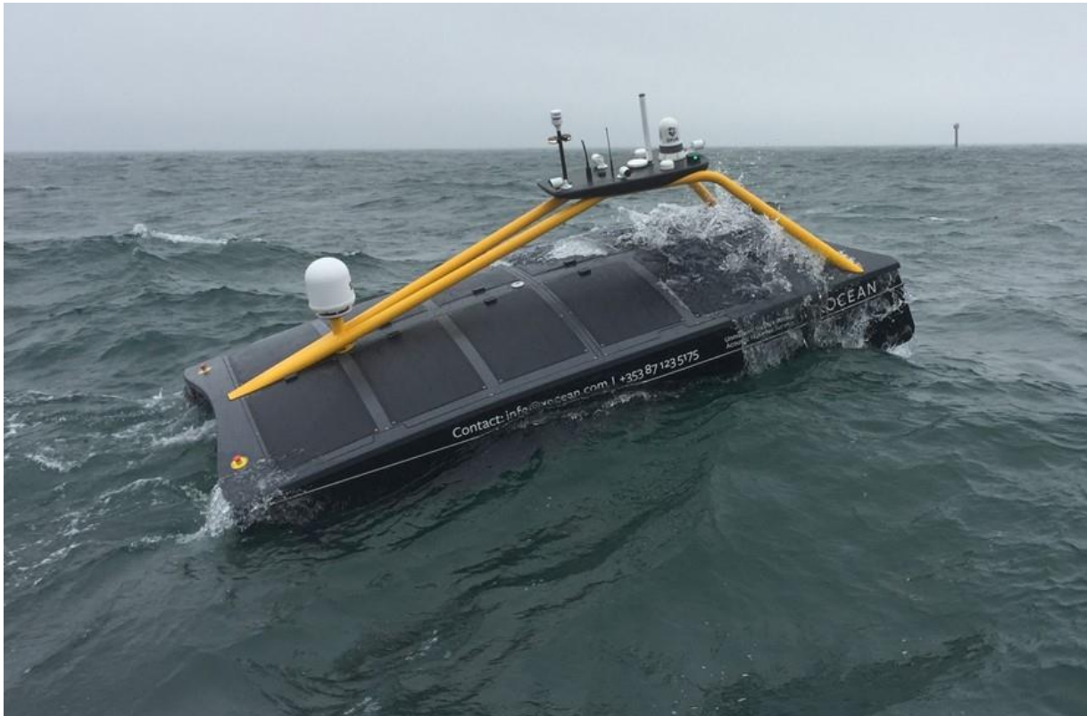
Figure 2: XO-450 USV

The USV sends real time images and situational awareness data over satellite to a team of operators keeping watch and controlling the vessel remotely 24/7.