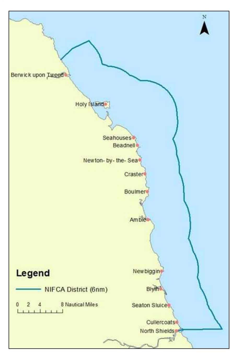
Figure 1 Boundaries of the Northumberland Inshore Fisheries and Conservation Authority district.

The NIFCA district extends from a line drawn through the centre of the River Tyne to the Scottish border out to 6 nautical miles and up to the normal tidal limit of rivers and estuaries (Fig. 1). The NIFCA district neighbours the North Eastern IFCA district to the south and Scotland to the north.